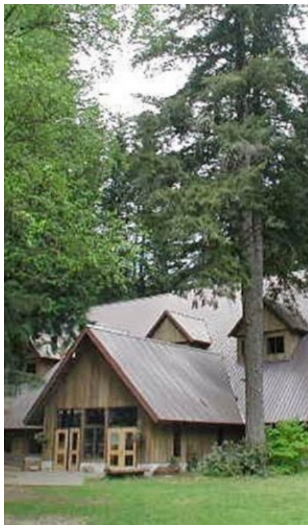
The Dining Hall at Squeah

27915 Trans Canada Hwy Hope, BC V0X 1L3 www.squeah.com 604-869-5353