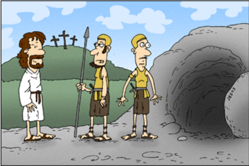
(See John 20:1-18) WELL PLAYED